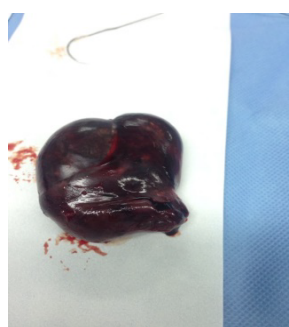
Figure 3: The right orchiectomy was done and left testis was fixed.