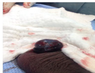
Figure 1: Right side scrotal exploration was performed and the testis was black and necrotic.

In operation theatre, right side scrotal exploration was performed and the testis was black and necrotic (Figures 1 and 2). The right orchiectomy (Figure 3) was done and left testis was fixed. Compressing dressing was done post-operation around the wound in order to prevent bleeding after the patient felt normal, he was transferred to the ward.