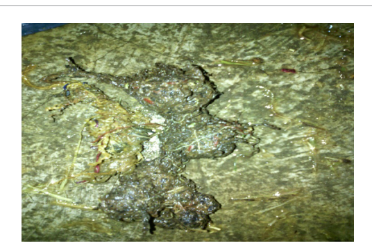
Figure 3: Calcified plastic from bovine reticulum.

and goats 60 (20%) examined 81 animals were found to be positive for indigestible foreign bodies. Multivariable logistic regression analysis showed that the prevalence of indigestible foreign body were insignificantly higher (p=0.064) in sheep (29.5%) than goats (16.6%) and sheep were 2.074 times more likely to ingest foreign body than goats (OR=2.074, CI, 0.958, 4.486). The prevalence in relation sex was also found to be insignificantly higher in female (27.9%) than male (23.9%). Females were found to be 1.137 times more susceptible than males (OR=1.137, CI=0.558, 2.317, p=0.723). Impaction due to foreign body occurred in small ruminant <2 years, 2-3 years and >3 years were, 16.6%, 23.3% and 33.3%, respectively. This difference was found to be statically significant (p=0. 031). Shoat >3 and 2-3 years were 2.564 and 1.459 time more likely to ingest foreign body than small ruminant under 2 years. The highest prevalence was observed in shoat greater than 3 years (OR=2.564, CI=1.160, 5.670) and between 2 to 3 years (OR=1.459, CI=0.601, 3.541) than shoat less than 2 years.