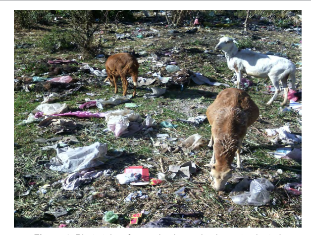
Figure 4: Photo taken from animals grazing in contaminated area in Asella town.

Tesfaye et al. [11,15,18,20-23]. This may happen because of ingestion of indigestible substances over a prolonged period.