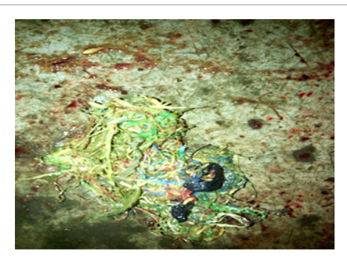
Figure 2: Mixed (Plastic and rope) recovered from rumen of goat.