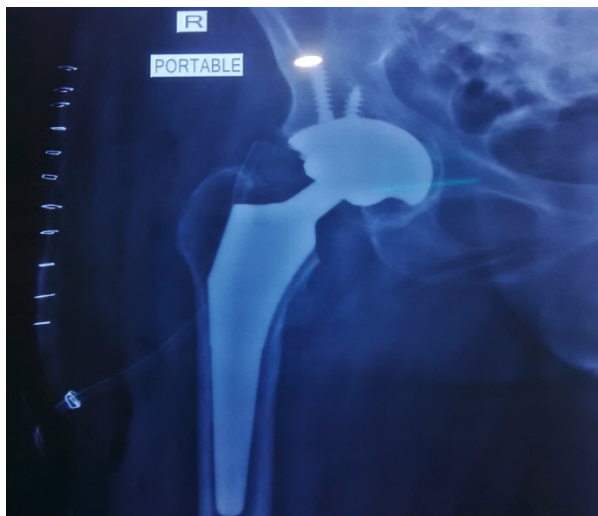
Figure 3: Post-operative X-ray of pelvis.