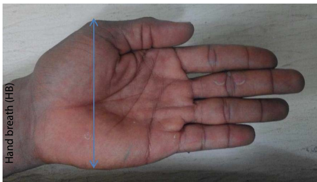
Figure 2: Shows the segmental landmarks for the Hand breadth (HB).

the proximal digital crease and the distal end of the third finger see Figure 1.