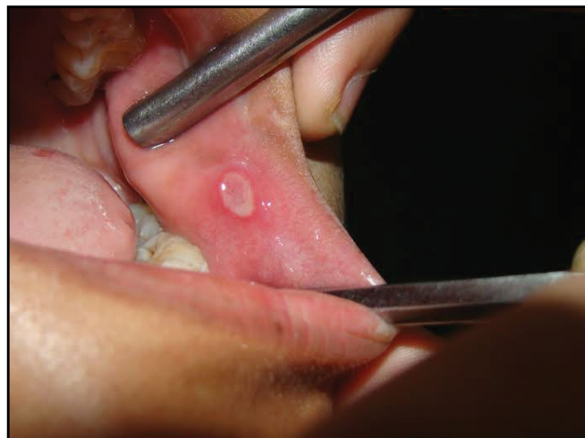
Figure 4. Clinical presentation of Aphthous ulcer.