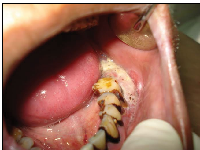
Figure 3. Clinical presentation of Squamous cell Carcinoma.