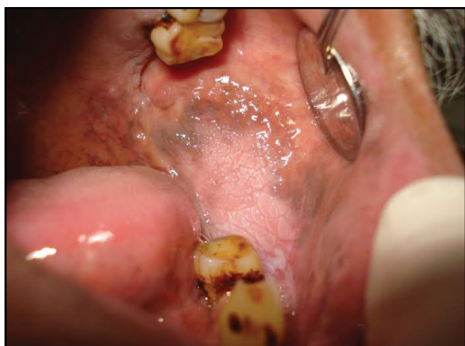
Figure 2. Clinical presentation of Leukoplakia.