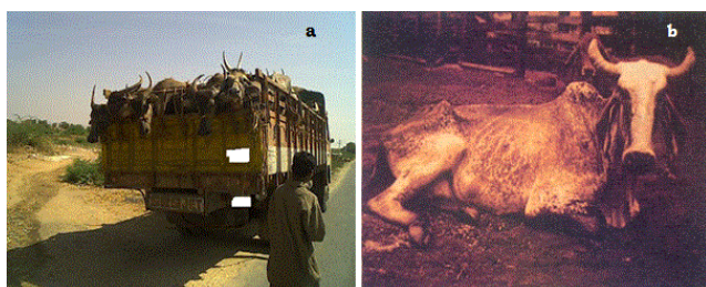
Figure 1: (a) Animals are being transported to slaughter house at a distance under most cruel conditions. Many of which might die or on the verge of death. (b) One such animal is suffering from degenerate sternum and general paralysis.

Beef is considered to be a very cheap source of meat in many developing nations including India. However, the unfortunate part is that in these nations beef cattle are not reared separately. The animals are usually either milch animals or beasts of burden. It is when these animals become old and are unable to provide any source of income (like milk or carry cargo on their back) to the farmers or owners then, these are sold to certain groups of peoples who slaughter them for the meat and the leather and the owners are paid some money for this. It must be remembered that by these time most of the animals are kept starving or are diseased with some form of illness. The picture below will illustrate such incidences (Figure 1).