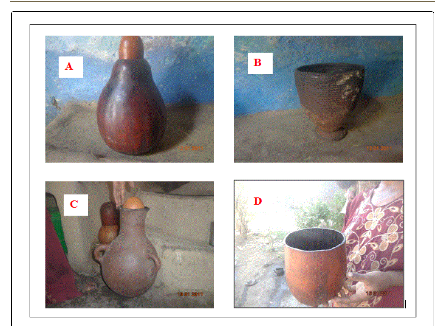
Figure 2: Traditional milk utensils (A= Etecha ; B= Chocho ; C= clay pot ; D= Okole ) used in the study area.