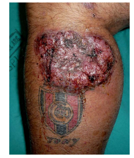
Figure 2: The same plaque one month later.

for atypical mycobacterias was negative. The histopathological study of the skin lesion revealed hyperkeratosis and acanthosis. The dermis showed inflammatory infiltrated comprising plasma cells, neutrophils and eosinophils mostly and areas of fibrinoid necrosis (Figures 3 and 4).