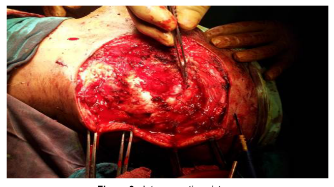
Figure 3: Intra operative picture.