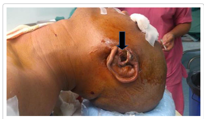
Figure 1: Preoperative picture showing polypoidal mass in left ear.

Histopathology was suggestive of poorly differentiated cerunimous adenocarcinoma. Surgical margins were free. Immunohistochemistry (IHC) was positive for AE1, Vimentin, S100 (diffuse) and suggestive of poorly differentiated adenocarcinoma. Patient was given concurrent chemoradiotherapy and was on regular follow up for 3 months postsurgery.