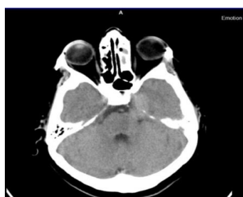
Figure 4: Orbits after surgery and medical treatment.

Immunohistochemistry (IHC) was positive for CD 68+, S 100+, CD 38+ in plasmatic cells, CD 45, CD 5, CD 3 stained mature lymphocytes and negative for HMB 45-.