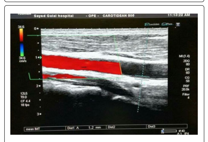
Figure 2: Measurement of IMT using Doppler US in a hemodialysis patient. IMT thickness = 1.2 mm. The increased IMT was directly linked to high levels of serum ADMA which was responsible for increased morbidity and mortality in these patients.

Figure 1: Receiver operating curve analysis of ADMA, (AUC) = 0.820. Best cutoff value of ADMA was 24.73 with sensitivity 98%, specificity 58%.