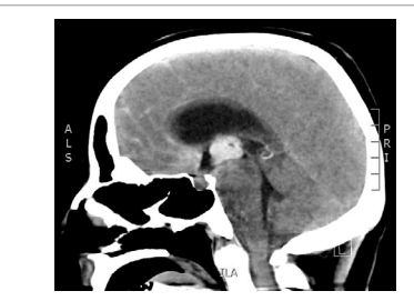
Figure 1: CT demonstrated hemorrhage that led to a delayed diagnosis of an aneurysmal rupture.

The initial CT performed at the peripheral hospital showed acute subarachnoid hemorrhage with fresh blood tracking along the course of the left middle cerebral artery into the Sylvian fissure (Figures 2). A hyperdense circumscribed lesion anteriorly in the third ventricle measuring 16 mm \times 13 mm \times 12 mm in diameter was reported. This lesion appeared to be continuous with a further component present in