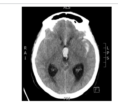
Figure 2: CT showed hemorrhage with fresh blood tracking along the course of the left middle cerebral artery into the Sylvian fissure .

the anterior horn of the left lateral ventricle 1.91 cm in diameter. The lesion was hyperdense posteriorly but isodense to the adjacent brain. No layering of blood was identified on the lateral or third ventricles.