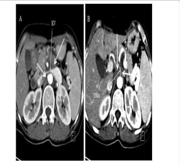
Figure 1: mContract-enhanced abdominal CT revealed irregular retroperitoneal soft tissue (arrows), unclear border, wrapped around abdominal aorta, the superior mesenteric artery (SMA) (A) and left kidney vein (KV) (B).

Clinical diagnosis included systematic lupus erythematosus and hemorrhagic erosive gastritis. Diagnosis of the idiopathic RPF was suspected, and primary medical therapy of idiopathic RPF is glucocorticoid 80 mg/d intravenous drip, with the treatment of the original disease with the leflunomide. Abdominal pain was relieved after treatment and the patient discharged to continue drug therapy at home. Patient was followed in clinic for about one year and repeat CT,