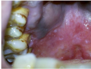
Figure 2: Oral cavity showing pinkish, erythematous ulcers involving the gingiva, hard and soft palate.