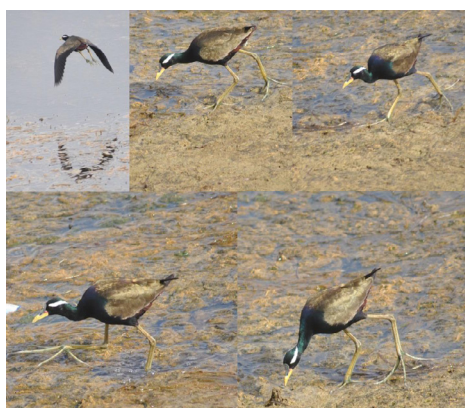
Plate 1: The wader, only member of the genus Metopidius Bronze Winged Jacana finding access to food resources in the exposed mudflat of Naregal tank.

Koradi Lake [13] and Bhadra Reservoir Project area [14] and Gudavi Bird Sanctuary [15].