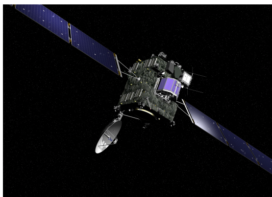
Figure 1: Rosetta

Rosetta was the first spacecraft to orbit a comet. It was built and launched as a robotic space probe by European space agency - European Space Operations Centre (ESOC), in Darmstadt, Germany. The aim of Rosetta is to study the comet with an orbiter and a lander module Philae (Figure 1).