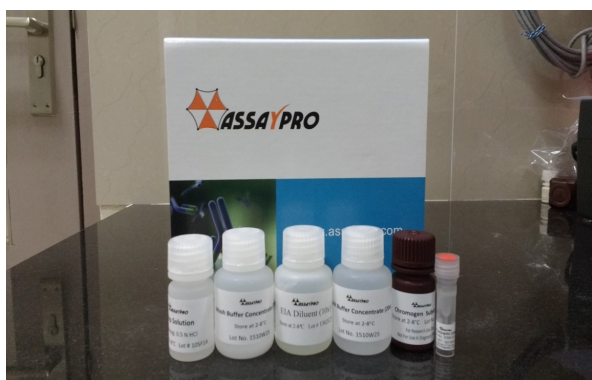
Figure 1: Heat shock protein 70 ELISA kit.