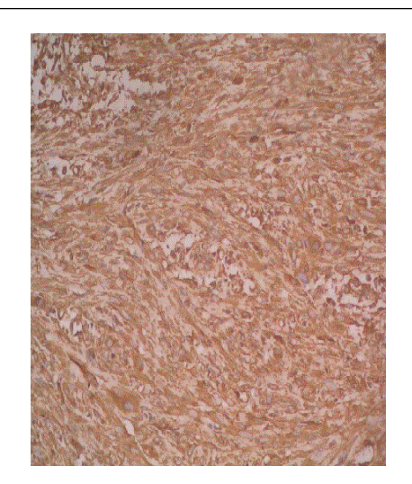
Photomicrograph 3: 10x10X: Immunohistochemistry –Vimentin: Strong cytoplasmic positivity

Large areas of necrosis were seen. Tumor was limited to the left ovary and capsular infiltration was not seen. A diagnosis of mature cystic teratoma with secondary malignant transformation into high grade sarcoma was rendered (FIGO Stage I). On Immunohistochemistry the tumor was positive for Vimentin (Photomicrograph 3) and Smooth Muscle Actin (Photomicrograph 4) however negatuve for Desmin and Cytokeratin. A diagnosis of leiomyosarcoma was confirmed on the basis of these findings.