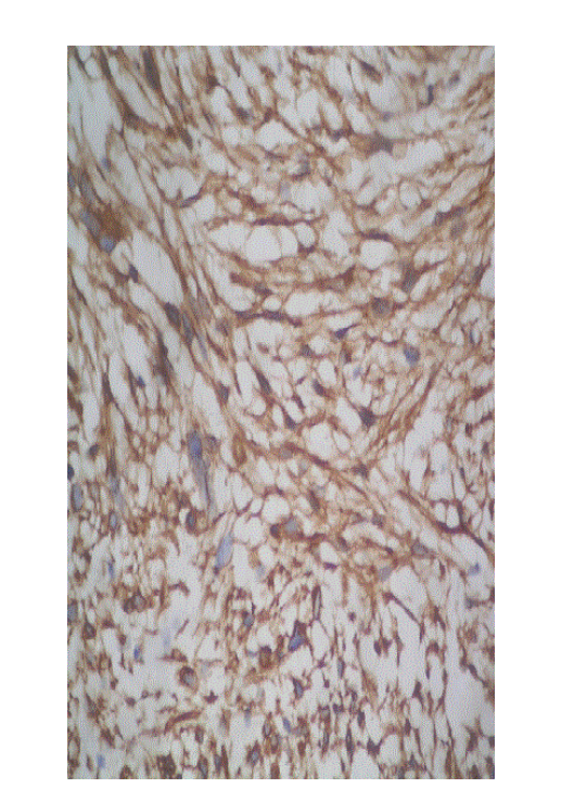
Photomicrograph 4: 40x10X Strong SMA positivity

Patient was given 2 cycles of chemotherapy (CAP regime-Cyclophosphamide 500 mg/m<sup>2</sup>, Adriamycin 50 mg/m<sup>2</sup>, Cis-platinum 50 mg/m<sup>2</sup>). Patient tolerated chemotherapy well and was discharged to come again for 5-6 courses of Chemotherapy at monthly interval.