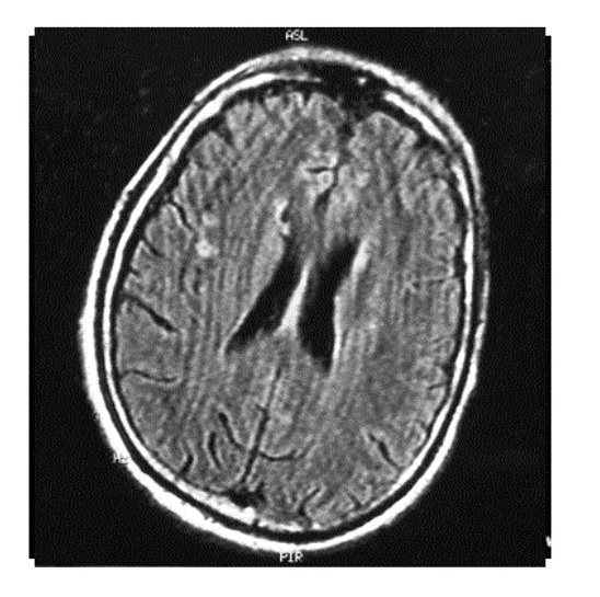
Figure 3: MRI showing nodular brain lesions.