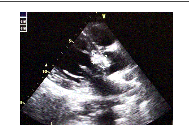
Figure 1: Transesophageal echocardiography showing vegetation magma at the aortic valve.

protein concentration of 3 g / l. Gram staining showed no germs on direct examination. The culture of CSF showed heavy growths of Klebsiella pneumoniae which was resistant to ampicillin and piperacillin, but sensitive to all other antibiotics. The same organism was identified in two pairs of aero-anaerobic blood cultures. The WBC count was 15,880 /mL, the hemoglobin level was 9.8 g/dL, the platelet count was 16000/mL and C-reactive protein was 79 mg / l. The urine culture was sterile. Moreover, viral serologies (virus hepatitis B and C, HIV) and syphilis were negative. The dosage of immunoglobulins G, A and M, Chest radiograph and computed tomography were normal. There was no evidence of endophthalmitis. Intravenous administration of Ceftazidime 100 mg / kg / day and gentamycin 3 mg / kg / day IV for two weeks, then four weeks of only ceftazidime. The antibiotic treatment was supplemented by emergent valve replacement. The evolution was good.