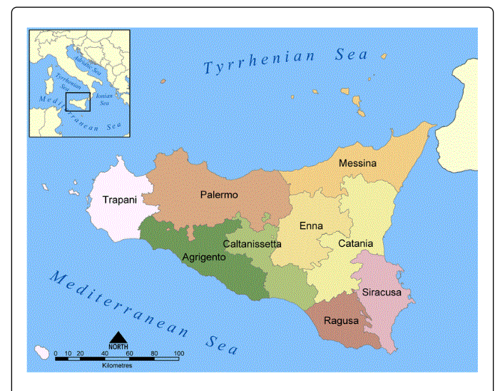
Figure 1: Provenience of dogs.

The study was conducted on 86 dogs from different areas of Sicily (Southern Italy), during the period May-October 2005. All the subjects differed for breed, gender, age and management (kennel, farm and family dog). Relatively to the origin, the dogs were divided as follows: 26 were from Caltanissetta (37.49°N, 14.04°E; 597 m. a.s.l.), 7 from Catania (37.5°N, 15.09°E; 19 m. a.s.l.) and 53 from Messina (38.19°N, 15.55° E; 59 m. a.s.l.) (Table 1 and Figure 1).