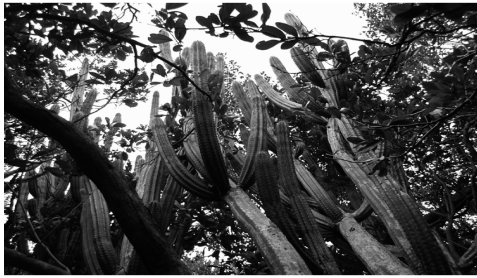
Figure 1: Trees of Pilosocereus robinii growing in the Florida Keys. These are estimated to be 5-6 m tall.