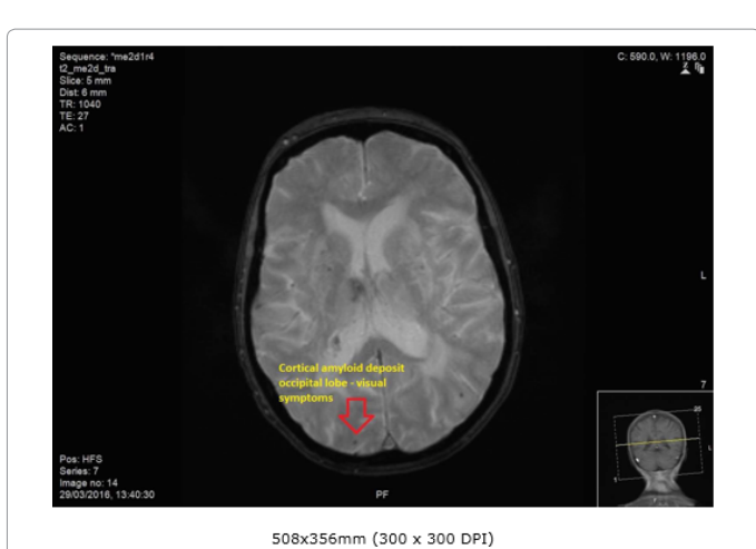
Figure 2: T2* image showing a possibly symptomatic microbleed in the occipital lobe.