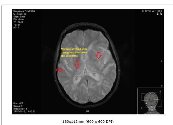
Figure 3: T2* MRI images showing multiple cortical and subcortical microbleeds.

The patient was experiencing recurrent stereotyped episodes of neurological symptoms which were not typical of TIA or acute cerebral ischemia, and did not correlate well with the acute infarcts visible on the MRI. TIAs typically cause a transient loss of function that can be localised to one vascular territory. They do not usually cause positive symptoms such as flashing lights or paraesthesiae, which are more typically associated with seizures or migraine.