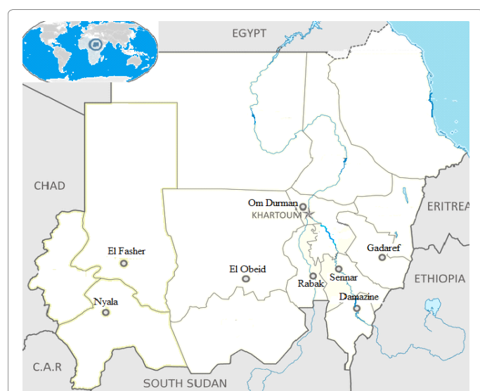
Figure 1: The republic of the Sudan, locations of the studied markets.

Cointegration test: Prices in spatially separated markets (or