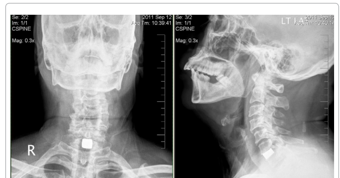
Figure 2: Post operative X-ray.

he received 3 doses of antibiotic (Cefuroxime) one at induction of anesthesia, and two post operatively.