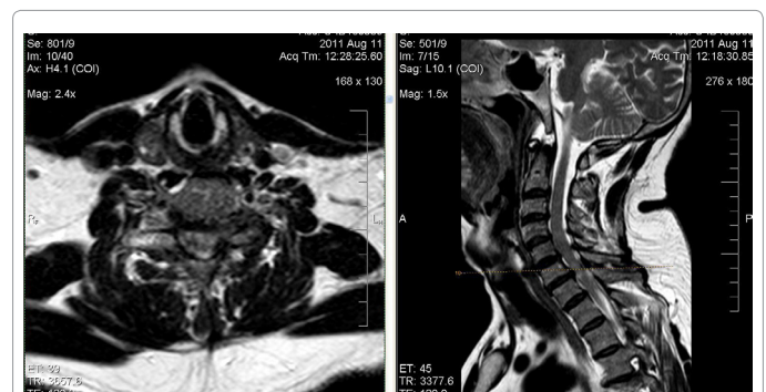
Figure 1: Preoperative MR images.

After routine pre-anesthesia work up, the patient underwent C6–C7 anterior decompression and cage fusion (Zimmer, trabecular metal cage) (Figure 2). The procedure was uneventful through a conventional left-side approach, under complete aseptic technique. The patient had a satisfactory recovery post operatively, with improvement of his sensations, and motor power of his upper and lower limbs, regaining his gait balance. The drain was removed in the first postoperative day;