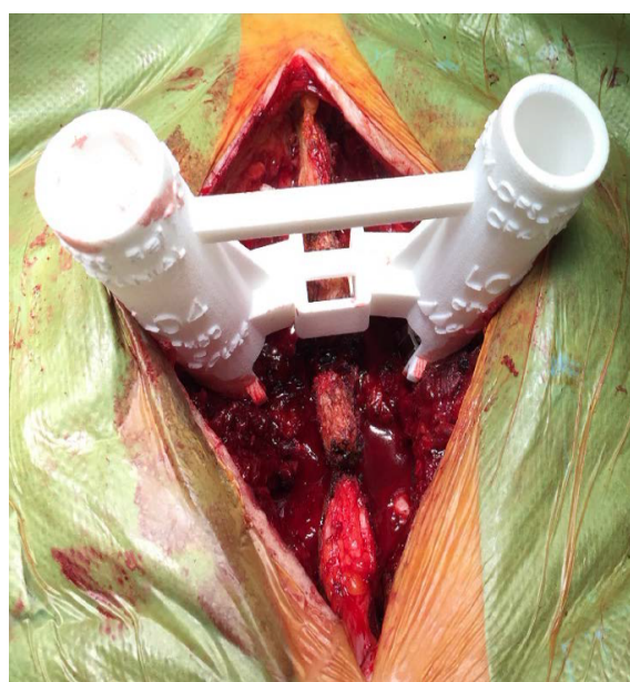
Figure 5: Intraoperative placement of the tubular guides.