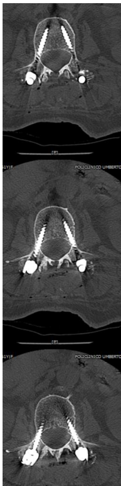
Figure 3: Postoperative CT scan in patient with neuronavigation-assisted pedicle screw placement.