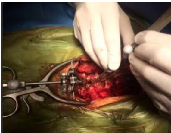
Figure 1: Intraoperative surface matching for neuronavigation.

Spinal Neuronavigation has shown to be a useful tool for planning and performing spinal procedures in degenerative, traumatic and oncological disease. Surgical navigation system is a system that processes medical images by computer graphics and image processing techniques and reconstructs 2-D and/or 3-D medical image models. It optimizes pre-operative planning, clarifies and secures screw placement, and reduces overall surgical morbidity. The neuronavigation system consists of a pointer to achieve image guidance during surgery. A 3D CT scan is performed before surgery and then the images are transferred onto the neuronavigation computer workstation. A surface-matching and paired-point technique (Figure 1) are used to mark the characteristic anatomical landmarks of the vertebrae. The frame of the navigator is then fixed onto a spinous process of a vertebra within the surgical area. The accuracy is usually within 0.5-1.0 mm, and the angular accuracy is typically within 1°.