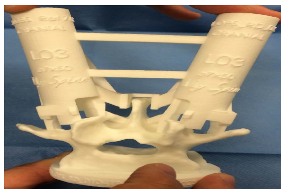
Figure 4: Tubular guides and vertebra model printed with 3D technology.

They constitute a customized solution for the patient. On the basis of preoperative imaging study, a thin slice CT scan (as for neuronavigation), and the surgeon elaborates the preoperative planning. Angulation and dimensions of the screws can be chosen and visualized in the three axes (axial, coronal and sagittal) to verify the alignment, the convergence, their position into the pedicle and the length of the screws within the vertebral body. After the planning has been accepted, it receives the approval by the surgeon and is elaborated by the owner firm that, in about 20 days, delivers the guides to the hospital. The material delivered for surgery includes: customized tubular guides for each vertebra needing instrumentation and a 3D model of the posterior elements of the same vertebra (Figure 4). The 3D model is useful for the surgeon so that he can visualize the anatomic landmarks where the guides are in contact with the vertebra. Usual anatomic landmarks are the spinous process, the laminae, the pars interarticularis and the transverse processes. The surgical exposure of the anatomical landmarks has to be really accurate, avoiding soft tissue between the bone and the tubular guides, in order to maximize the precision of the system (Figure 5). The technique requires an adequate exposure: the surgical incision should allow the