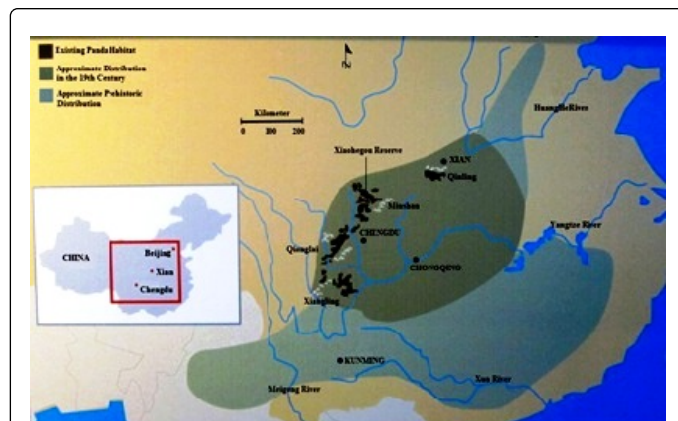
Figure 1: Historical change of the habitats of giant panda, Resource: Giant pandas in a Changing landscape, Loucks).

Giant panda, as a symbol of China, is an endangered and world-class protected species and thus getting a lot of attention from scientific research all over the world. Giant pandas' troops used to cover provinces of Yunnan, Hunan, Hubei, Shanxi, and Henan in history of more than 2,000 years ago. However, from around 1,000 years ago, habitat of giant panda began to reduce dramatically, and the decline has been more significantly during the recent 200 years. In the 19th century, there were still giant pandas living in northern Hubei, western Hunan and eastern Sichuan, but now the pandas in these areas have all been extinct [1] (Figure 1).