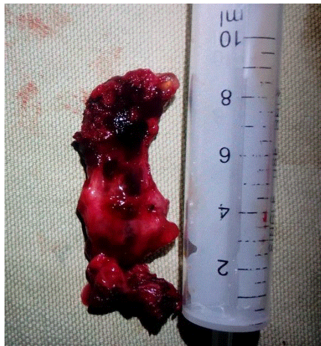
Figure 3: Excised specimen.