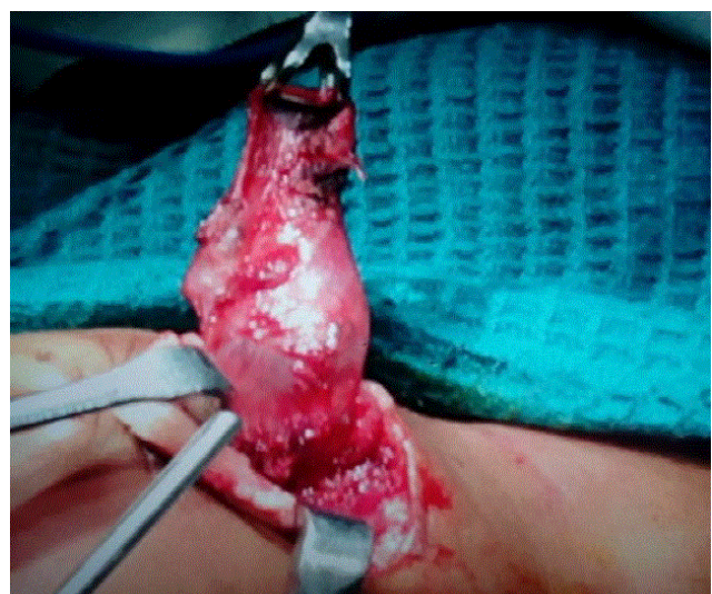
Figure 2: Following dissection of the mass from the surrounding tissue.