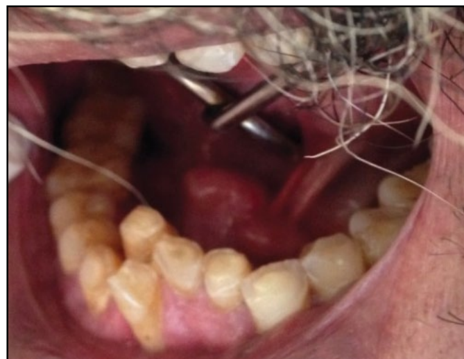
Figure 1. (Preoperative intraoral view showing the swelling in floor of mouth).

Orthopantomogram revealed (OPG), presence of