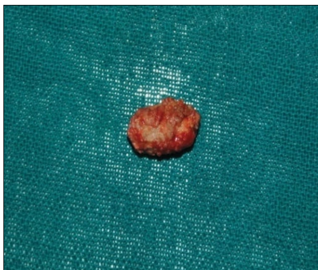
Figure 5. The Sialolith measuring 2 \times 1.1 cm in size.