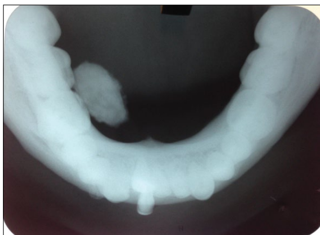
Figure 3. Trans-occlusal radiograph showing sialolith in the right body of mandible).