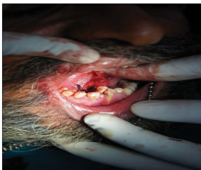
Figure 6. Intraoperative view of sutured duct after sialolith removal.

The postoperative period was uneventful and patient was prescribed analgesics and increased intake of water.