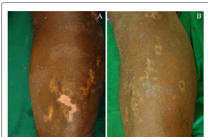
Figure 2: A: Patient prior to therapy, B: the same patient after three months of needling with 5 fluorouracil.