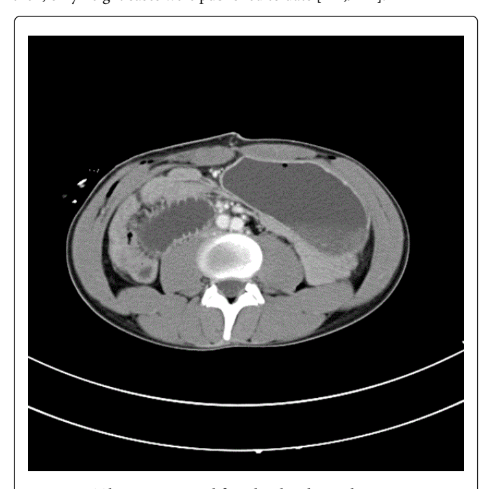
Figure 1: CT large gastric and first duodenal part distension.

small bowel obstruction after total proctocolectomy with ileo anal-pouch anastomosis, as seen in this case, has been reported in 6-25% of patients [7,8], but the involvement of the superior mesenteric artery syndrome was not clearly established. Following an ileo anal-pouch anastomosis, the first case is reported by Ballantyne [3] on 1987, and then, only height cases were published to date [2-4,9-11].