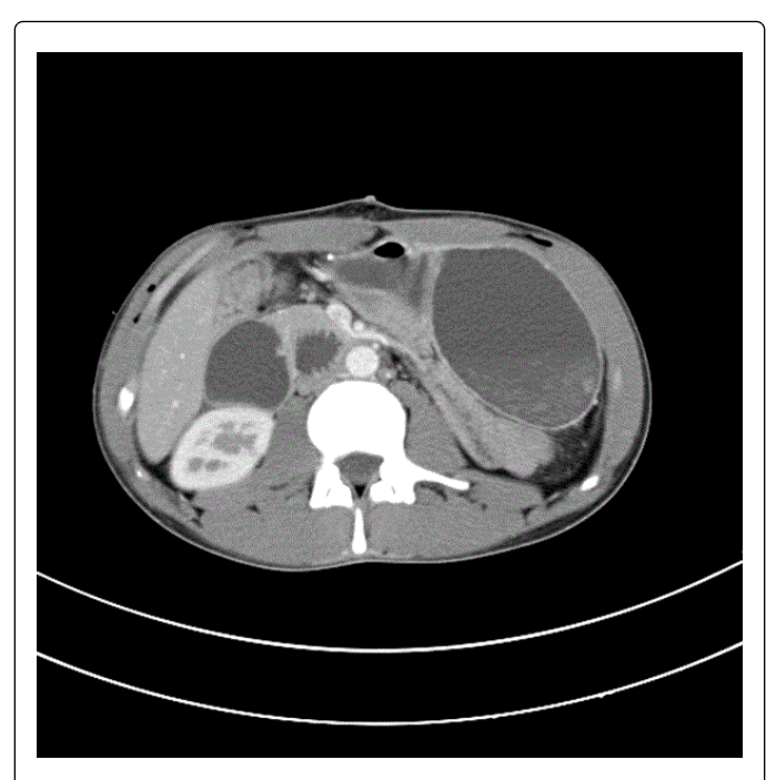
Figure 2a: The third duodenum part is occluded between the superior mesenteric artery and aorta.