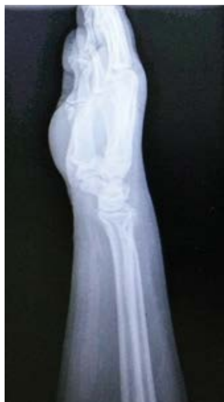
Figure 3: 6 month follow up x-ray right wrist PA and lateral views.

nuclei and abundant indistinct cytoplasm. Occasional clusters show pronounced cytologic atypia. However, mitotic activity/necrosis is not noted in any of the smears. Cytological features favour a primary cartilage containing reactive lesion.