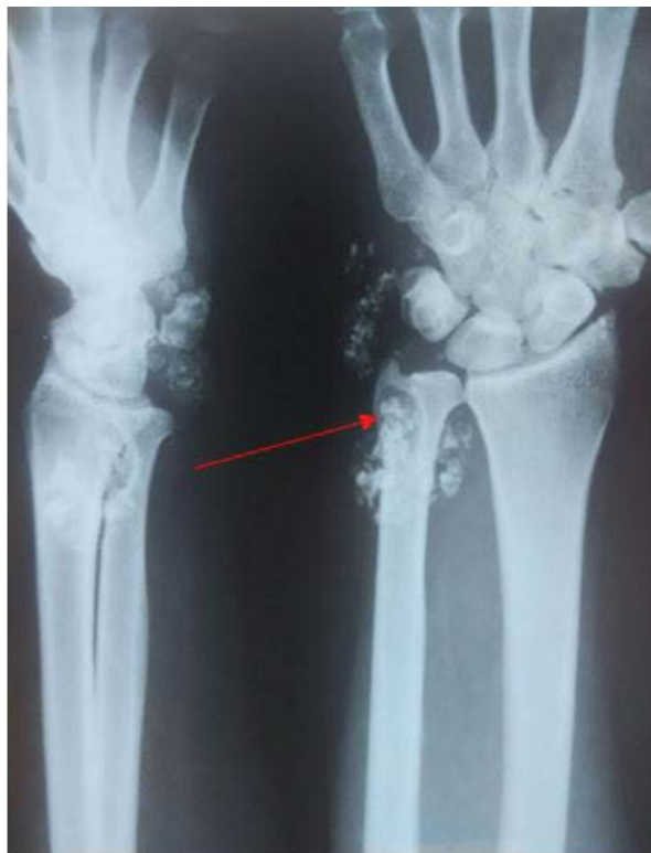
Figure 1: PA and lateral X-rays of the right forearm and wrist showing calcified nodules consistent with synovial chondromatosis. Superficial cortical scalloping of the distal ulna is noted (apple core appearance).