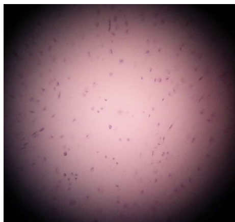
Figure 6: 10 x magnification shows cartilage tissue without atypia.

discussion on whether synovial chondromatosis is a neoplastic process or a reactive metaplasia. It can be mistaken for malignancy and hence a combined clinical, radiological and histopathological approach helps in accurate diagnosis. There is no substantial risk for local recurrence but long term follow- up is necessary to gain more insight in the behaviour of this rare condition.