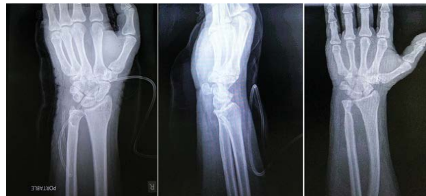
Figure 2: Post op x-ray right wrist PA and lateral views.