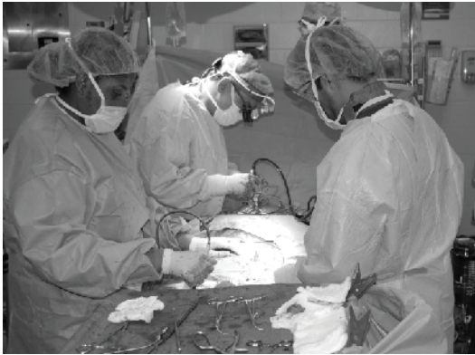
Figure 2. Intraoperative image demonstrating operative field and performance of simultaneous TSS surgery.

Minor complications included acute blood loss anemia in 6 of the 9 patients (66%) who required perioperative blood transfusion. Perioperative blood transfusion amount averaged 1.7 units of packed red blood cells (range 0-4 units), with an intraoperative average of 0.77 units and a postoperative average of 0.88 units. TSS surgical cases requiring blood transfusion involved those cases requiring more than 2 cervical and lumbar decompression levels combined with the use of cervical instrumentation. No patient experienced further complication related to blood loss anemia.