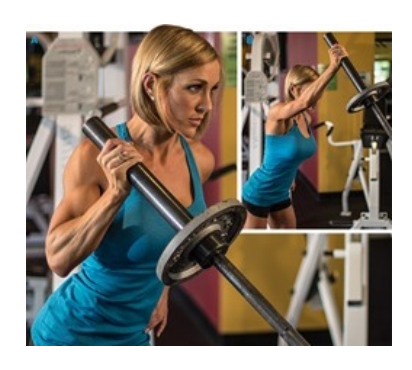
Figure 3: Image showing the women at training program

The leading cause of injury in the US Army is musculoskeletal injuries, accounting for almost 31% of hospitalizations for male and