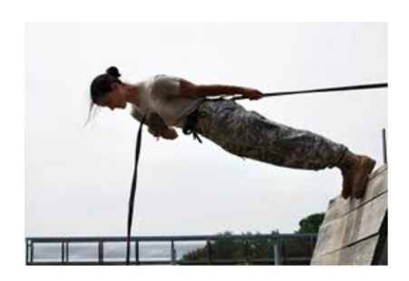
Figure 2: Image showing the Women Addressing Upper Body Strength

A recent story reported by multiple media outlets stated that female Marines in boot camp are failing the upper body strength portion of the PRT at a rate of 55%. While statistics such as this are a reason for concern, the emphasis should be on the physiological and training issues to move toward understanding and addressing the factors surrounding this situation (Figure 2). In other words, rather than