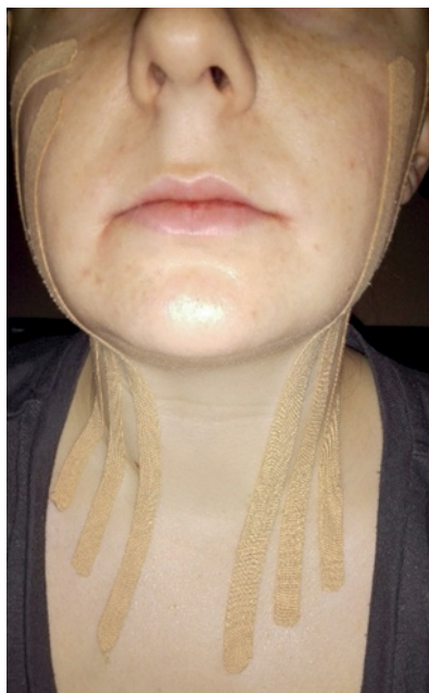
Figure 1: KTG application 6hours post-operative and facial oedema.