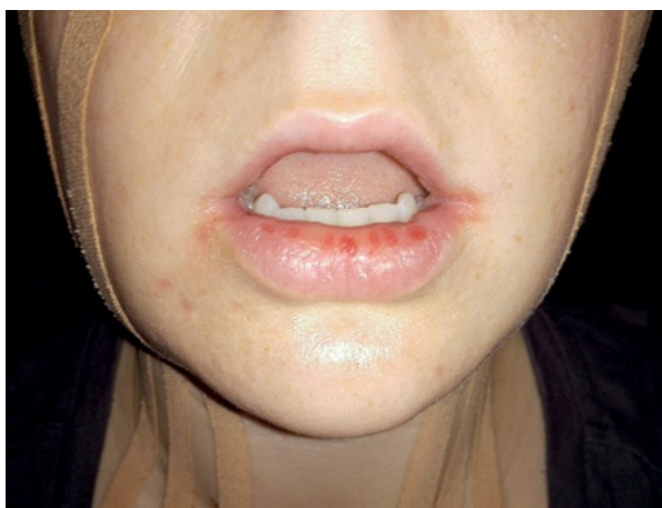
Figure 2: KTG application showing trismus 6hours post-operative.