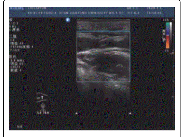
Figure 4: Ultrasound showed the femoral artery rupture disappeared, no color blood flow through the femoral artery rupture into the pseudoaneurysm.

Patients were positioned in the supine position, with limbs straightened. Femoral artery lesions were imaged using real-time twodimensional and color Doppler ultrasound. The position, number, size, blood supply, perforated artery, and body of aneurysms were evaluated. The path of the treatment needle was chosen according to the relationship of the pseudo aneurysm to the femoral artery, using color Doppler ultrasound. T-branched tubing was attached to the 20G puncture needle, allowing injection of normal saline and or thrombin. Normal saline was injected when the tip of the needle was observed to be in the cavity of the pseudo aneurysm. Thrombin was slowly injected until the perforation was closed, and the needle then removed. Color Doppler ultrasound was used to ensure there was no blood flow into the pseudoaneurysm after treatment. High intensity echoes were seen filling the pseudoaneurysm after successful treatment (Figure 4).