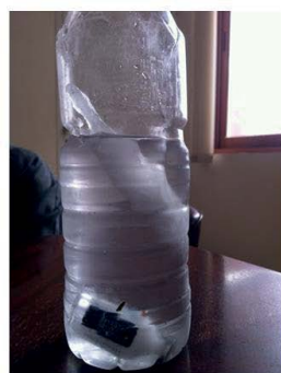
Figure 2: Some patients kept their insulin cool by keeping the vials in a bottle of cold water, or if cold water was not available, they kept their insulin vial in any bottle of water, not necessarily a bottle of cold water.

caused a shortage in many of the medications and supplies needed for diabetic patients. Many patients lost their jobs and health insurance, which added to the stress from the continuous airstrikes on the city of Sana'a.