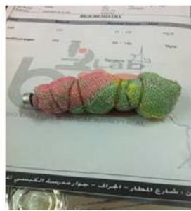
Figure 1: Examples of some of the different ways to keep insulin vials cool, such as putting it next to a bottle of cold water or wrapping it in a wet cloth.