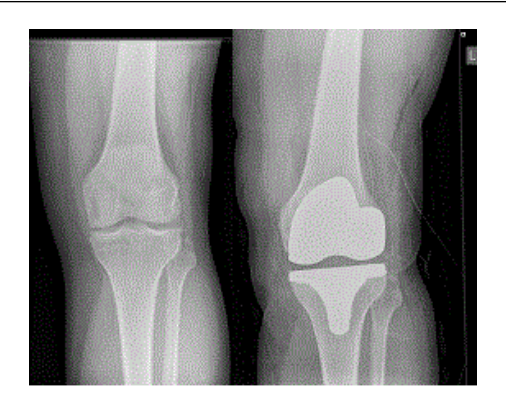
Figure 1: Patient's left knee radiographs pre and immediately post operation

A 59 year old male with a medical history of hypertension, non-insulin dependent diabetes mellitus, angina and benign prostatic hyperplasia whom underwent simultaneous bilateral primary total knee arthroplasty surgery for osteoarthritis (Figure 1). The patient received Atracurium 50 mg IV at the induction of general anaesthesia for muscle relaxant purposes.