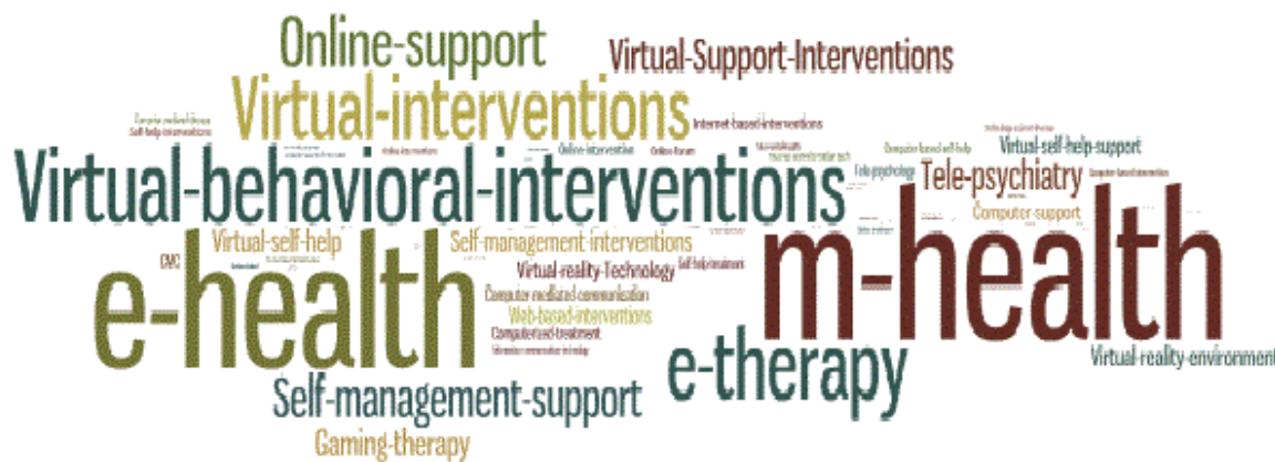
Figure 2: The keywords used in eHealth literature. The font size of each keyword corresponds to its frequency in publications retrieved from Pubmed and Medline.

Distant communication between a therapist and a client is not a new concept: already in 19th century Sigmund Freud extensively used letters to communicate with his clients [3]. Since the first study of eHealth in 1977 [4], helplines became the means of delivery, and in the 21st century Internet became the most common platform for eHealth services, permitting the use distant communication on a large scale for health care service delivery.