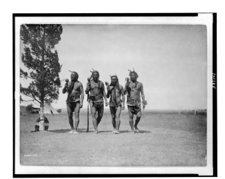
Figure 5: Image of our ancestors.

Paracelsus gained much of his knowledge and experience from travelling and observing in different parts of the world. He was the first noted deviant from the Galenic tradition and he was vilified by his contemporaries. So he must have had something right! North American Indian medicine men were the bridge between modern herbalism and the vitalist beliefs and practices of our ancestors (Figure 5). For them the whole of the natural world was harmonious and life giving. Their knowledge of herbalogy and the empirical knowledge passed down through the generations was the basis of folk medicine.