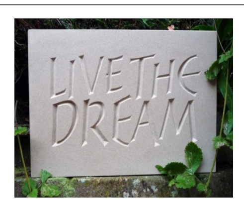
Figure 7: Fine art of stone carving.

During the case taking she reveals that she trained in fine art. Her passion is stone carving. In particular she loves to do very precise lettering; measured in millimeters. She says she is a perfectionist in this - not perfect; not good enough (Figure 7).