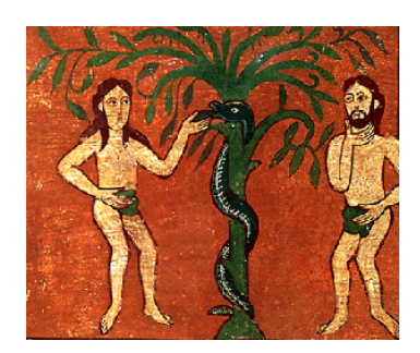
Figure 3: Mankind hiding behind big leaf.

Some authorities say this is also about the male and female principles; with the serpent as the female; goddess principle; prefiguring the idea that the female was the first possessor of power and knowledge. But it's also the Tree of Life which is represented and the outcome of that is self-knowledge. It represents the core of the human condition. When mankind tasted of the fruit; they received the ability to look into and examine the true condition of life; and it proved to be more than they could bear. So we hide behind a fig leaf! (Figure