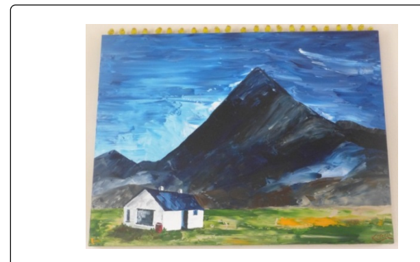
Figure 6: Painting.

This was the case which first suggested to me that art was a way into prescribing. It was the case of a young mother - an artist - who was trapped in life with the baby and she loves and cares about the baby strongly at the same time as wanting to escape. I gave her Pulsatilla and Staphysagria; Later; I saw thIs picture on the wall and asked about it. She said it represented freedom. She had painted it. To me the picture was very brooding (Figure 6).