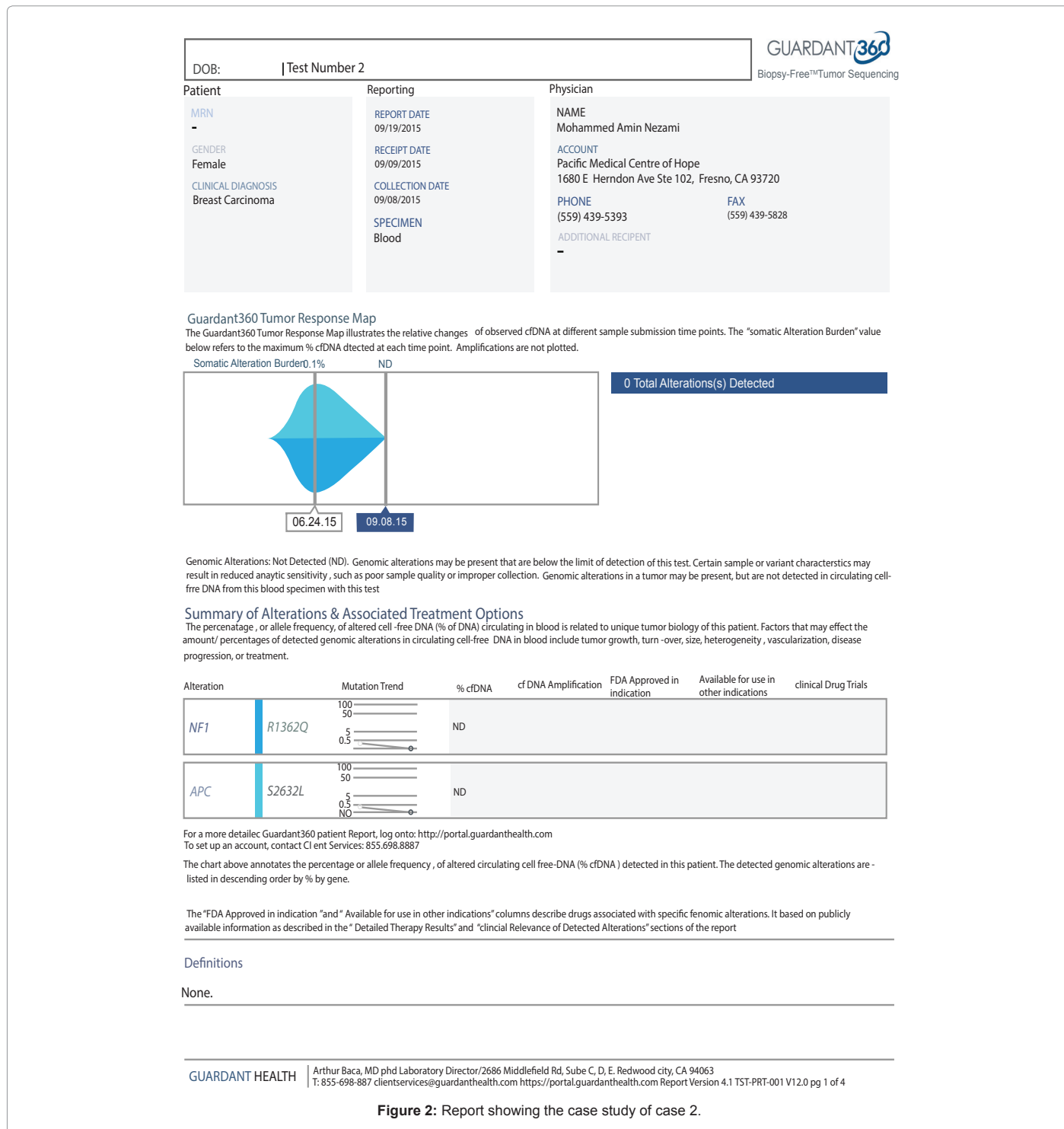
Figure 2: Report showing the case study of case 2.

and axial lymph node resection in November 2012, which was positive for 2 LN invasions. Upon her arrival at our clinic, she had recurrence of her tumor, with two large palpable sites in the chest on skin. She was complaining of a new onset consistent and dry cough, and was concerning for lung metastasis. Upon evaluation, we ordered a PET scan, which showed multiple pulmonary metastasis bilaterally, which were too numerous to count, with an SUV max of 4.8. She had multiple masses in right breast with max SUV of 12.9, and multiple smaller lesions with max SUV of 5.5, plus mediastinal and internal mammary