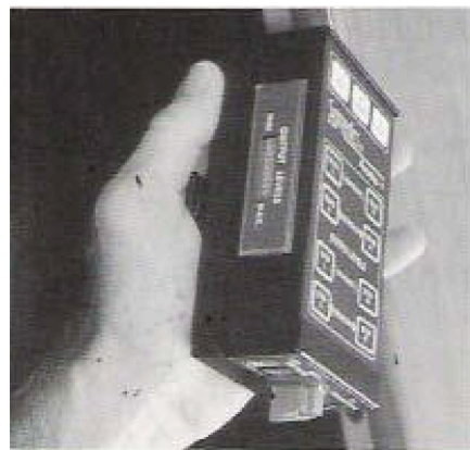
Figure 1: The Parastep system.

The Parastep system (Figure 1) thus consists of the stimulator and control unit (Figure 1) and of 3 auxiliary units: (1) six stimulation noninvasive skin electrodes; (2) four-legged stability walker, and (3) shoe-insert AFOs. In addition there is wiring between units 1 and 2. There is also wiring from the main unit to auxiliary units (1) and (2). The latter can be eliminated if Bluetooth wireless is used.