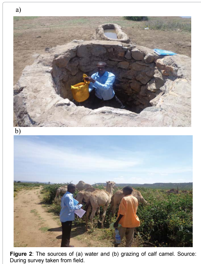
Figure 2: The sources of (a) water and (b) grazing of calf camel.