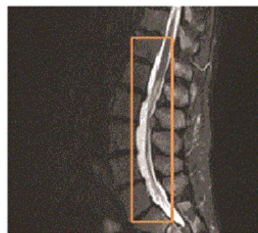
Figure 2: Midsagittal STIR image of the thoracolumbar spine taken approximately 2 months after the initial MRI, as seen in Figure 1. This image shows interval near-complete resolution of the subarachnoid hemorrhage, correlating to the patient's spontaneous and gradual improvement in his symptomatology.

Over the course of the next 8 days, the patient had steady improvement in his lower extremity function. By the time he was discharged, he was able to ambulate with a walker and his leg strength was approximately 4/5 bilaterally. He was discharged to home with therapy. At his 6-week office visit after discharge, the patient was found to have full strength in both legs, was able to ambulate with some mild difficulty, but was improving. An interval MRI of his lumbar spine was performed 2 months after the initial MRI, which revealed interval subtotal resolution of the intrathecal hemorrhage (Figure 2).