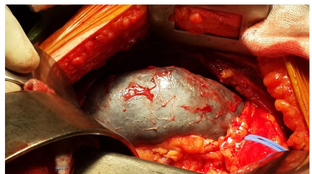
Figure 1: Post exposure while open donor nephrectomy the kidney was black coloured.

Since all her investigations were normal we posted her for open left donor nephrectomy. On exposure the kidney was found to be black coloured (Figure 1).