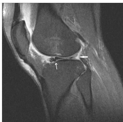
Figure 4: Sagittal T2-weighted MR image through the lateral compartment shows the bucket-handle fragment of the lateral meniscal tear (thin white arrow), posterior to the anterior horn, producing the flipped meniscus sign. Absence of the posterior horn was also noted (thick white arrow).

could not but choose an inferior treatment modality to excise both the medial and lateral menisci of bucket-handle tears (Figures 5-7). After operation, the patient was instructed to avoid vigorous sport and heavy labor work, in order to delay the occurrence of early knee osteoarthritis. One month later, the knee got full range of motion. Two months later, the patient reported no pain on his right knee. At our patient's follow-up examination twelve months after injury, his right knee was painless and stable with a full range of motion. The patient was suggested for regularly follow-up once a year.