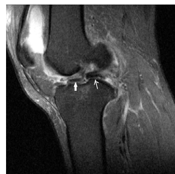
Figure 1: Sagittal T2-weighted MR image through the intercondylar notch shows displaced bucket-handle fragments of both medial (thin white arrow) and lateral (thick white arrow) meniscal tears like two consecutive silkworms

Under the impression of traumatic bucket handle tear of both medial and lateral menisci and ACL tear, the patient was submitted to arthroscopic surgery. On arthroscopic examination of both the medial and lateral compartments, incarceration of the medial and lateral compartment full length bucket-handle meniscal tears into the intercondylar notch was observed. Mild knee joint intra-articular effusion and the ACL partial tear with mild laxity were also noted. Since repair of such full length of medial and lateral meniscal of bucket-handle tears needed sophisticated skills beyond our reach, we