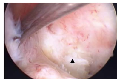
Figure 6: ACL partial tear was noted during arthroscopy. Remnant of bucket handle tear of medial meniscus after menisectomy was removed later (black triangle).