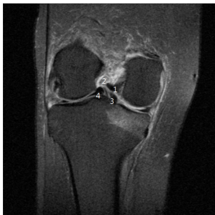
Figure 2: T2-weighted coronal MR image shows four structures in the intercondylar notch to produce the “quadruple cruciate sign”: (1) normal PCL; (2) increased signal ACL due to edematous change and partial tear; (3) displaced bucket-handle fragment from medial meniscal tear; (4) displaced bucket-handle fragment from lateral meniscal tear. Bone contusion in the medial tibial plateau is also noted.