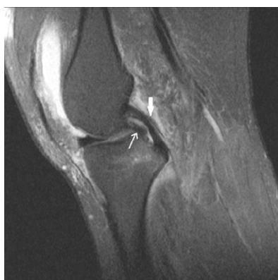
Figure 3: Sagittal T2-weighted MR image through the inter-condylar notch shows the double-posterior cruciate ligament (PCL) sign, which is characterized by the presence of a the displaced bucket-handle fragment of the medial meniscus (thin white arrow) lying parallel and anterior to the PCL (thick white arrow). Moderate joint effusion due to hemarthrosis is noted.