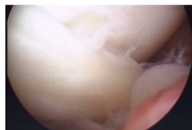
Figure 7: The bucket handle tear of lateral meniscus was noted arthroscopy.