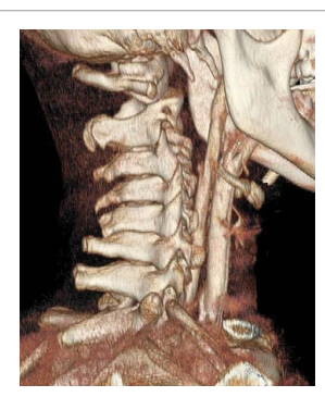
Figure 1: CT 3D image reconstruction, prior to the surgical procedure. Dislocation of the right atlanto-occipital joint, subluxation of the left atlanto-occipital joint and subluxation on the right side at the C1-C2 level.