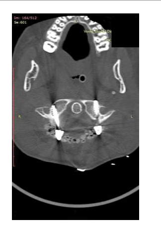
Figure 4: CT image after surgery (occipital-cervical fusion).

When assessing the cervical spine injuries, given the developmental differences in the pediatric population they should be divided into two groups: younger children – up to nine years of age and older children – over nine years of age [11-13]. Injuries in children and adolescents under the age of two years are extremely rare and are recognized as cases of shaken baby syndrome [13-15]. Younger children mainly suffer from damage of the upper cervical spine, i.e. the occipital-cervical part up to the Cl and C2 level [13]. These children are also more likely to sustain ligament injuries, leading to instability at that level and neurological disorders, more often than fractures [11,15]. In older