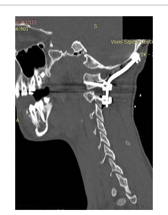
Figure 5: CT image after surgery (occipital-cervical fusion).