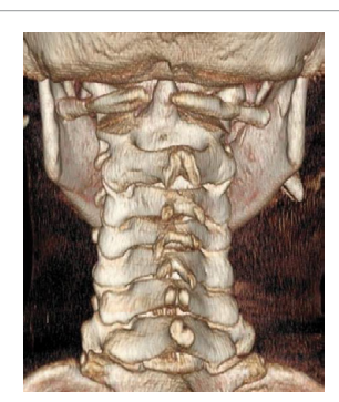
Figure 3: CT 3D image reconstruction, prior to the surgical procedure. Dislocation of the right atlanto-occipital joint, subluxation of the left atlanto-occipital joint and subluxation on the right side at the C1-C2 level.

and he was fed orally. Due to patients' inability to stand, he was taught to use a wheelchair. Four months after the injury he was discharged home in good general condition with recommendations to continue pharmacological treatment and further rehabilitation.