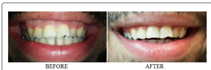
Figure 4: The third patient before and one-month after surgery.