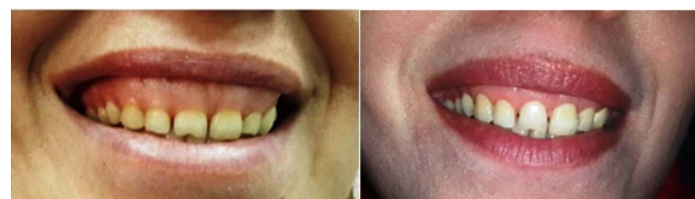
Figure 8: The seventh patient before and one-month after surgery.