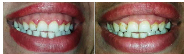
Figure 5: The fourth patient before and one-month after surgery.