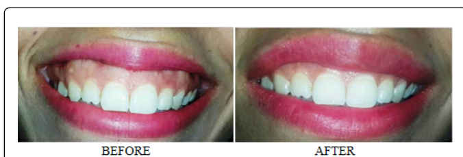
Figure 3: The second patient before and one-month after surgery.