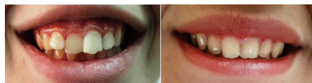
Figure 6: The fifth patient before and one-month after surgery.