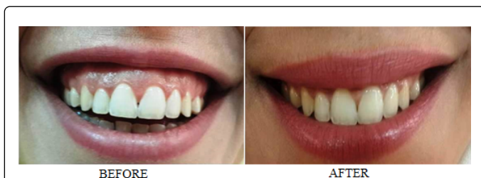
Figure 2: The first patient; before and one-month after surgery.

The results indicated a significant decrease of gingival appearance of about 3.30 mm (Figure 1). Figures 2 to Figure 8 demonstrate the all cases of patients before and one-month after surgery.