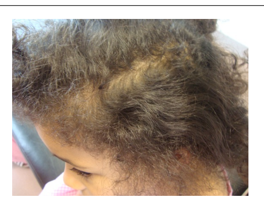
Figure 3: Clinical resolution of alopecia after two months treatment.