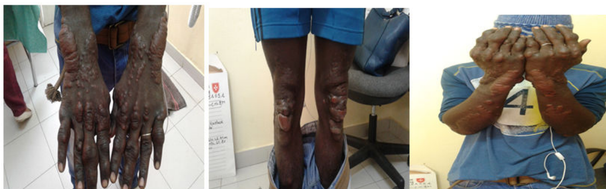
Figure 3: Tuberous xanthomas located at pressure areas.