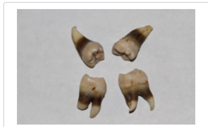
Figure 3: Four recently extracted third molar teeth from 21- year old man who had been taken tetracycline and minocycline at the age of 16. The discoloration is at the middle third of the root.